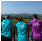
Students enjoying the view

A highlight of this month is our Enrichment week. Students in Years 7 and 8 go on a variety of exciting excursions and trips, whilst Year 9 will go further afield on residential adventures to the Peak District and Greece amongst other places and will have the opportunity to develop transferable skills such as leadership, resilience, and teamwork.