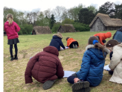
Pupils explore the site