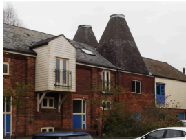
Newport Station Maltings

The classic form of a maltings reflects the various processes which took place within the building. Grain was hauled in through the lucam or hoist housing at one end of the building where it was then steeped in water to start the germination process. The grain was laid out on germination floors before growth was halted at a particular stage by applying heat in the kiln at the other end of the building. The process of initiating and then halting germination is known as malting .