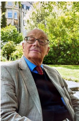
John's College in 1973.