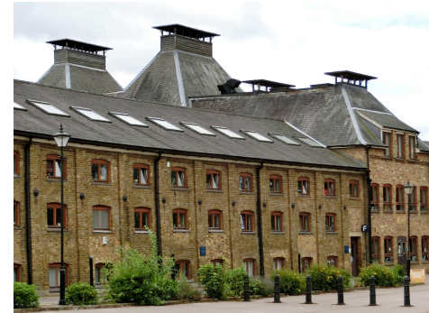
Stanstead Abbots -former maltings now a business centre