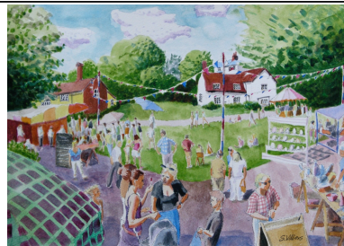
Hadstock Village Fete, 2pm, 15 th June see page 5