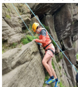
Don't look down

As part of our Enrichment programme, students are also able to gain a variety of National Qualifications. Year 8 can take part in the Silver Arts Award validated by Trinity College in London and Year 9 can take part in the Gold equivalent. We are very lucky to be able to offer this as the Gold Award is usually a Sixth Form undertaking and carries a certain number of UCAS points.