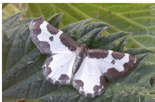
Clouded border moth