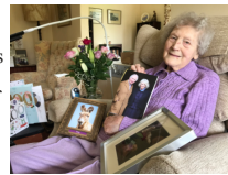
Celebrating 100 years