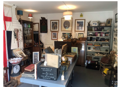
Inside the garden room