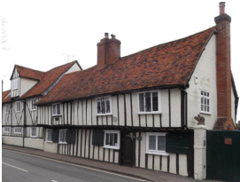
Manuden Old Maltings

Manuden, Arkesden and Great Chesterford. In Little Hallingbury there is Malting Farm and The Old Brick Malting . As well as conversion to private houses, surviving maltings have been renovated and converted to a variety of uses.