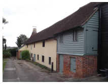
Great Dunmow Maltings

THE Hundred Parishes includes much of the extensive barley-growing area of the Hertfordshire and Essex borders. The malting of barley in preparation for its use in the brewing industry was a significant activity in several of our larger villages and market towns, especially along the River Stort, from the 18th to the 20th centuries.