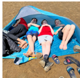
Students enjoying the sun

As part of our Enrichment programme, students are also able to gain a variety of National Qualifications. Year 8 can take part in the Silver Arts Award validated by Trinity College in London and Year 9 can take part in the Gold equivalent. We are very lucky to be able to offer this as the Gold Award is usually a Sixth Form undertaking and carries a certain number of UCAS points.