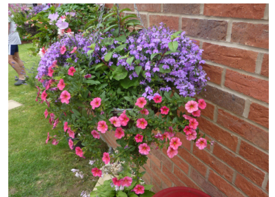
A beautiful hanging basket