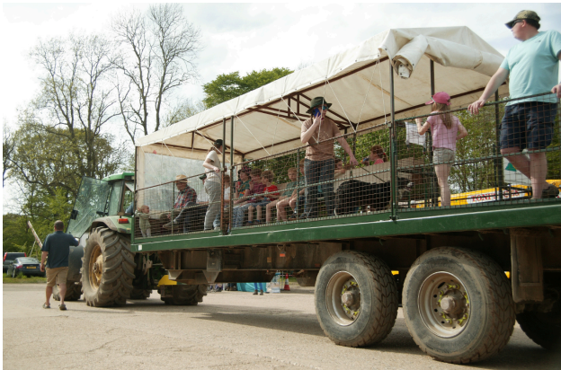
Trailer rides proved very popular!