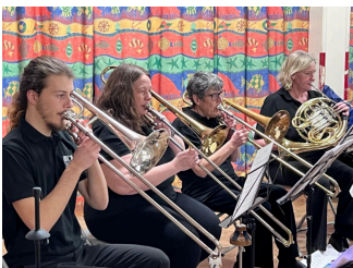
Linton Jazz Members having a Bash